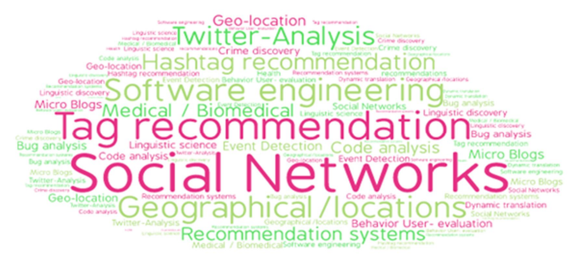
Fig2. A clear vision of the application of Topic modeling in various sciences (Based on previous work).

With the passage of time, the importance of Topic modeling in different disciplines will be increase. According to previous studies, we present a taxonomy of current approaches topic models based on LDA model and in different subject such as Social Network(McCallum et al., 2005) (Wang et al., 2013) (Henderson and Eliassi-Rad, 2009, Yu et al., 2015a), Software Engineering(Linstead et al., 2008) (Chen et al., 2012) (Gethers and Poshyvanyk, 2010) (Linstead et al., 2007), Crime Science(Chen et al., 2015) (Gerber, 2014) (Wang et al., 2012) and also in areas of Geographical(Cristani et al., 2008) (Yin et al., 2011) (Sizov, 2010) (Tang et al., 2013), Political Science(Greene and Cross, 2015) (Cohen and Ruths, 2013), Medical/Biomedical (Liu et al., 2010) (Huang et al., 2013) (Wang et al., 2011) (Zhang et al., 2017) (Xiao et al., 2017) and Linguistic science (Bauer et al., 2012) (McFarland et al., 2013) (Eidelman et al., 2012) (Wilson and Chew, 2010) (Vulić et al., 2011) as illustrated by Fig. 2.