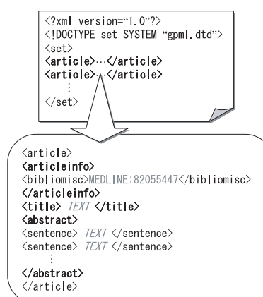
Fig. 1. Configuration of GENIA corpus.

Recently, we released GENIA corpus version 3.0. It consists of 2000 abstracts taken from MEDLINE database, and contains more than 400 000 words and almost 100 000